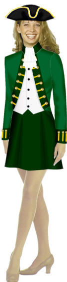
Patrick Henry High School San Diego, Ca

This sketch designed by and property of DeMOULIN BROS. & CO., Greenville, Illinois 62246 We want to be YOUR uniform company